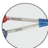
Printed Priming Volume